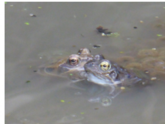
Breeding frogs in upper pond