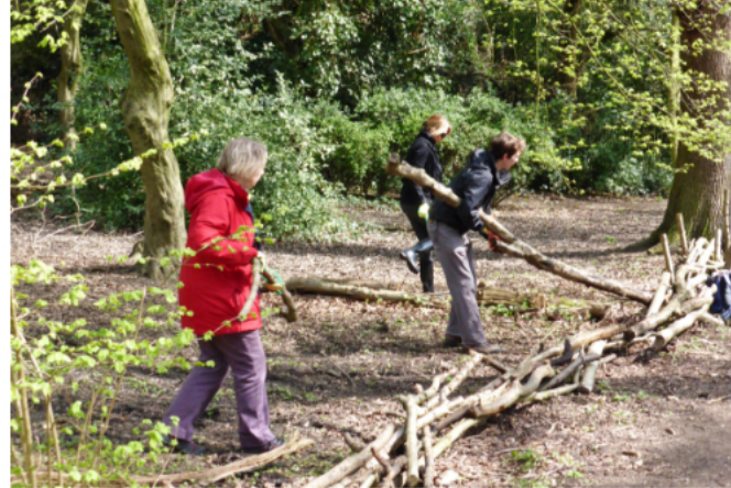
Volunteers in Queen's Wood

hope you will have a chance to meet him at a future event. As well, Haringey still has a dedicated Parks team but all the green spaces in Haringey rely on volunteers. Here in Queen's Wood we have a loyal group of friends and volunteers who are the eyes and ears caring for the wood – essential for the future.