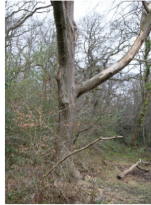
Tree with Ash Die Back

At last the wood is fully in leaf probably 3 to 4 weeks later than last year. First out as usual were the hawthorn and elder at the end of March and by the middle of April the hornbeams were greening up - but it was not until the end of the month that the oaks were in leaf. The ash as usual will be last. Sadly we have discovered some ash saplings with die-back disease